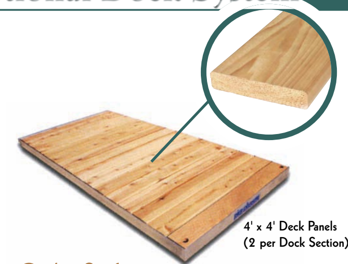
4' x 4' Deck Panels (2 per Dock Section)

Extruded aluminum deck planks are painted with a baked-on enamel finish that has a light gray textured surface. The grooved design is attractive and assists with quick water drainage. The aluminum deck panels are durable and will last for many years.