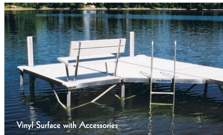
Vinyl Surface with Accessories