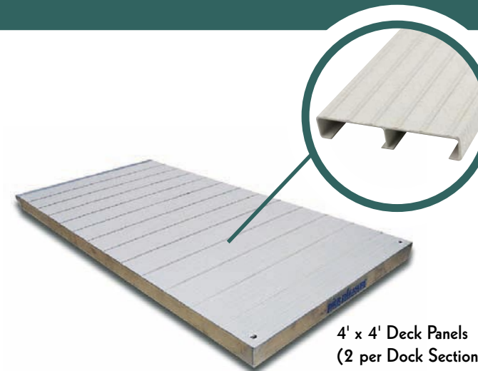
4' x 4' Deck Panels (2 per Dock Section)