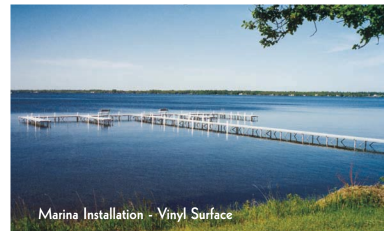
Marina Installation - Vinyl Surface