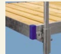
Optional End Cap

See pages 32 and 33 for accessories, description of decking options and typical dock configurations.