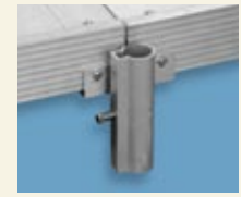
Bolt-On Post Brackets