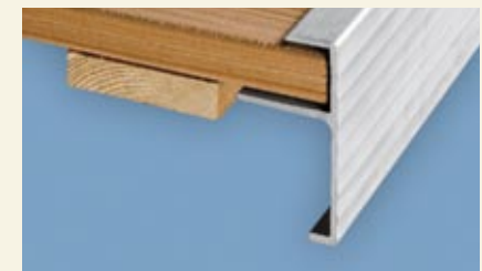
Deck and Side Rail Construction