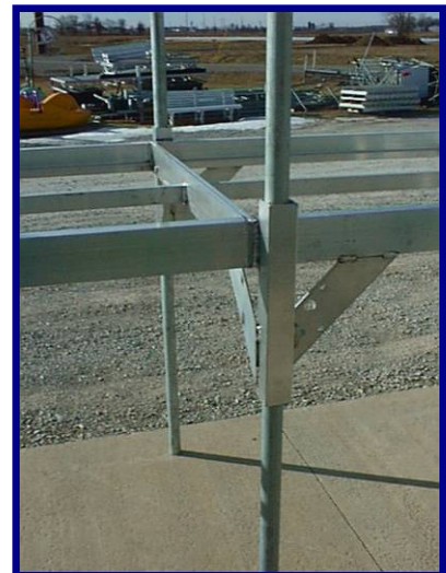
HEAVY DUTY AVAILABLE FOR ROUGH WATER APPLICATIONS