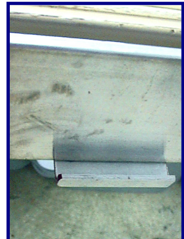
C-CHANNELS HOLD EACH SECTION FOR EASY BOLTING