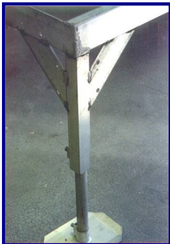
LEGS BRACED FROM BOTH SIDES FOR STABILITY (Classic, Heavy Duty, & Heavy Duty – TF)