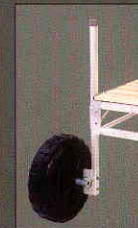
SHORE END WHEEL KIT