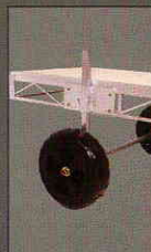
ECONOMY DOCK WHEEL KIT