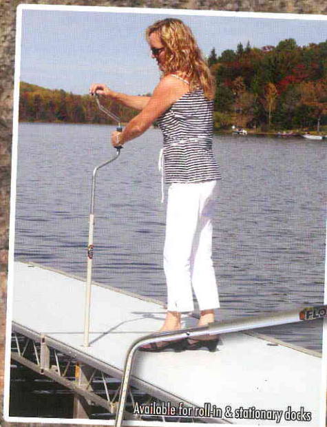
Available for roll-in & stationary docks

Handrails add safety, ease and access to your dock system. 42" tall aluminum safety handrails are extra sturdy and have clean rounded radial corners.