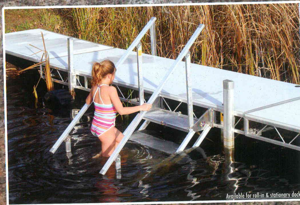
Available for roll-in & stationary docks