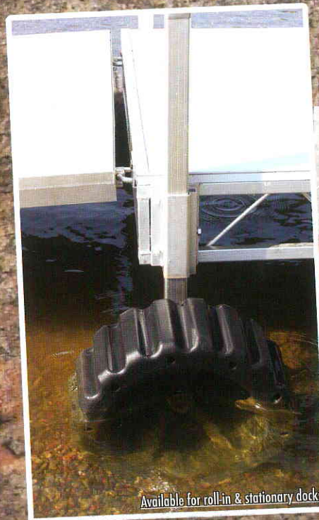
Available for roll-in & stationary docks

FLOE's heavy-duty aluminum cleat is perfect for tying off your boat. Mounts to the frame of dock as shown or using a bracket on a floating dock. Cast aluminum cleat is 7" long. Works for roll-in, stationary and floating docks.