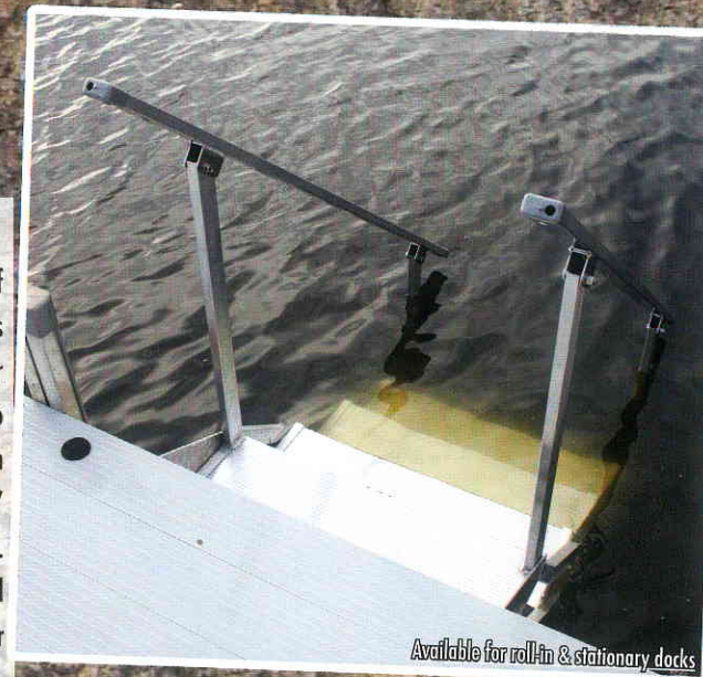
Available for roll-in & stationary docks

Dock steps make it as easy to get out of the lake as it is to jump in. The steps have an all-aluminum construction for a lightweight, long-lasting addition to your dock. The accordion style design will accommodate water depths up to 32" (four step style) and 53" (six step style). The extra deep 12" steps and standard handrail make this a great solution for lake users of any age.