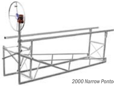
2000 Narrow Pontoon