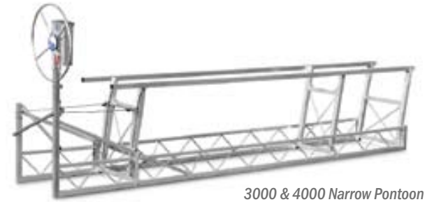
3000 & 4000 Narrow Pontoon